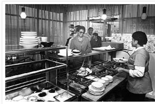
February 1982 photo of the original location