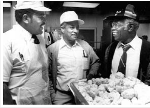
November 1989 photo