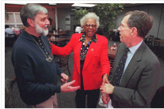
March 1997 interior shot with some of the regulars